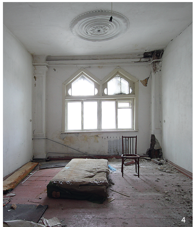
4 Tomsk: The Soldiers' Synagogue, upper floor (the former women's gallery, now subdivided into rooms) with original ceiling, windows and pillars.

After the Revolution of 1917, the Russian Civil War of 1918–21, and the firm establishment of Soviet rule in Siberia, new developments began. On the one hand, many Jews emigrated abroad to escape Communist rule. On the other, new Jews arrived from the former Pale of Settlement, especially in the 1930s, when Stalin's industrialization policy turned some