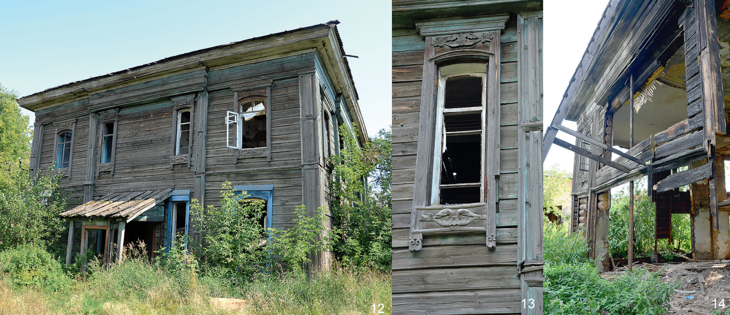
12–14 Kansk: Synagogue, view from southwest (12), window frame (13) and northeastern part of the building, destroyed by fire (14).

The synagogue was built on the main street between 1894 and 1896 (Fig. 8). Closed by the Soviet authorities, it served as a sports club and later as a post office. Originally the brick synagogue had a dome above its prayer hall, but it was demolished during the Soviet era. All other features of the building are still intact: attic walls with Stars of David emphasizing the entrances to the synagogue in the western part of the building, the apse in the east where the Torah ark stood and plaster frames on the walls of the prayer hall between the windows (Fig. 10). Currently the building is abandoned and is quickly deteriorating. The interior bears signs of recent fires, and piles of syringes testify to the local drug-addicts who settled there. The rabbi's house situated nearby is used today as an office building.