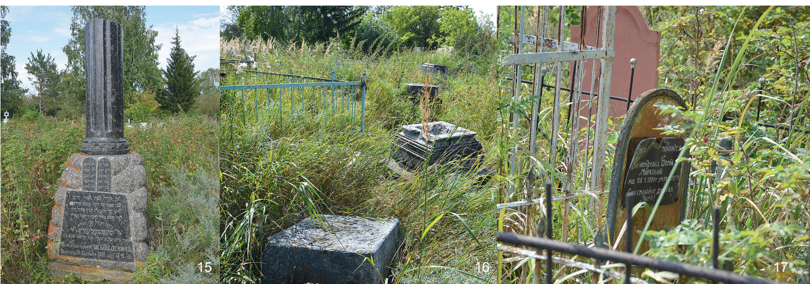
15–17 Kansk: Jewish cemetery.

The CJA team also surveyed the Jewish section in the local cemetery (Figs. 15–17). Jewish tombstones were covered with dog-rose bushes and it took us considerable time to find them. The most impressive gravestone in the cemetery is the monument of Isaac Shepshelevich from 1900: a stone base decorated with Tablets of the Law and surmounted by a black marble column (Fig. 15). The motif of the Tablets of the Law was very common in pre-revolutionary graves in the Kansk cemetery. Among the tombstones from the Soviet period there are many with Hebrew epitaphs and Stars of David.