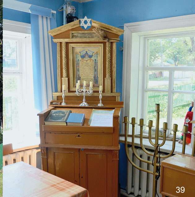
38–39 Birobidzhan: Beit Tshuva Synagogue, view from northwest (38) and the amud in the prayer hall (39).

engage in agriculture in their homeland and freely develop their national culture, in its Soviet, Yiddish-based variant.