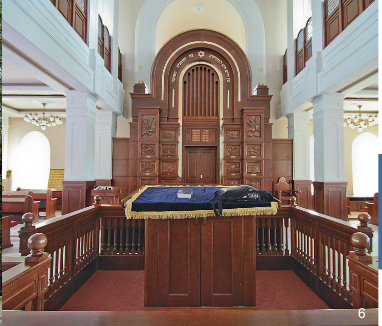
5–6 Tomsk: The Choral Synagogue, view from northeast (5), interior towards the Torah ark (6).

of the Siberian towns into important industrial centers. In 1928, the Birobidzhan area at the Soviet-Chinese border was proclaimed the Jewish Autonomous Region, and a substantial number of Jews settled there, engaging in agriculture.