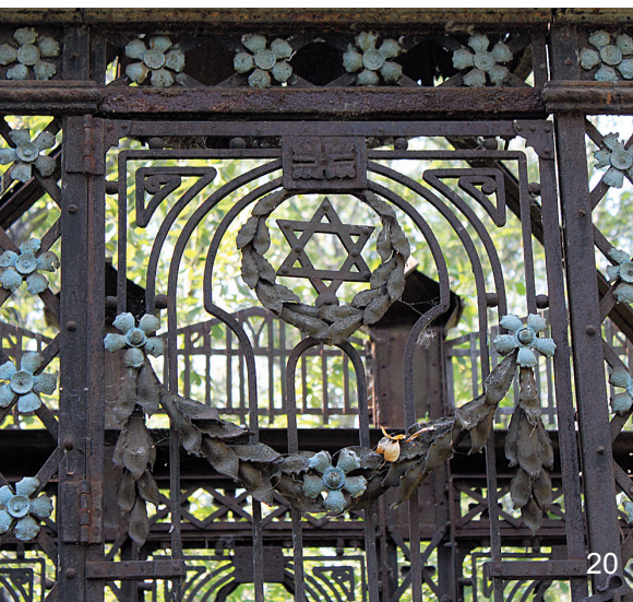
20–22 Irkutsk: Jewish cemetery.

The Jewish cemetery in Irkutsk is remarkable for being the largest and most well preserved cemetery in the region. Pre-revolutionary tombstones reflect the wealth of the local Jews, their adherence to the Jewish tradition, as well as their significant acculturation into the Russian society (Figs. 20–22).