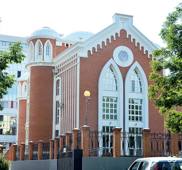
35–37 Khabarovsk: Synagogue, view from west (35), interior towards the Torah ark (36) and Torah mantle found in the local museum (37).

Birobidzhan, named after two rivers, Bira and Bidzhan, was established in 1928 as the center of the Jewish Autonomous Region. The creation of the Jewish Autonomous Region was an initiative of the Soviet government, an alternative to the Zionist project, which Soviet Communists considered utopian. Still the Jewish Autonomous Region was meant for the same purpose: to transform Jews into territorial people who