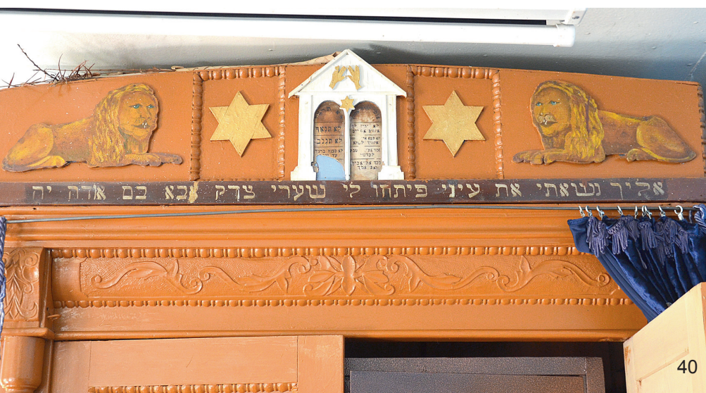
40–41 Birobidzhan: Beit Tshuva Synagogue, Torah ark (40) and detail of the western façade (41).

The new Chabad synagogue and communal center Freid were also surveyed. The synagogue includes a small Jewish museum, where other objects from the 1956 synagogue were found. The team also documented the collection of Jewish objects in the Regional Museum. All of them were brought to the museum from the Ukrainian town Sharhorod in the early 1990s. Among these objects there is a Torah finial produced in Vienna, bearing a Hungarian dedicatory inscription from 1924.