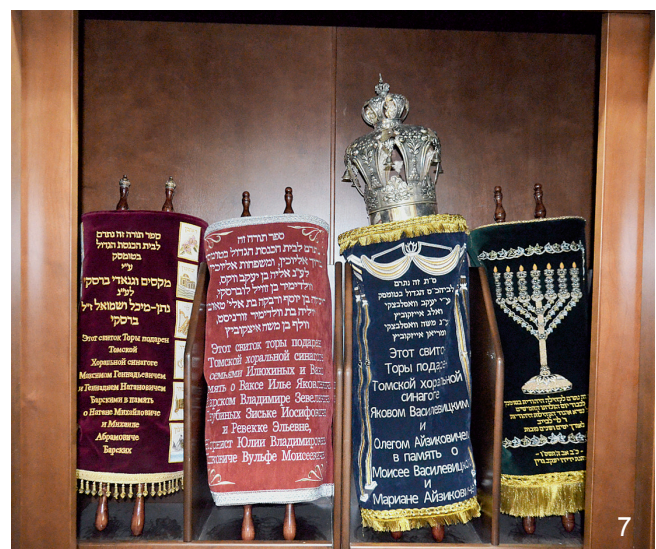
7 Tomsk: The Choral Synagogue, Torah scrolls inside the Torah ark.

In Tomsk, the starting point of our expedition, Jews arrived in the first half of the 19 th century as convicts and as cantonists. In the late 19 th century, Tomsk was already a home to a Jewish community of 3,000 (6.4 % of its total population). There were three synagogues, a Jewish cemetery and numerous Jewish institutions. Today there are about 600 Jews and an active religious community. The community life is concentrated around the Choral Synagogue (Fig. 5). It was established in 1850 and its current building was erected in 1902. Soviet authorities closed the synagogue in 1929 and used the building to house various administrative institutions. They also removed the cupola, which emphasized the interior placement