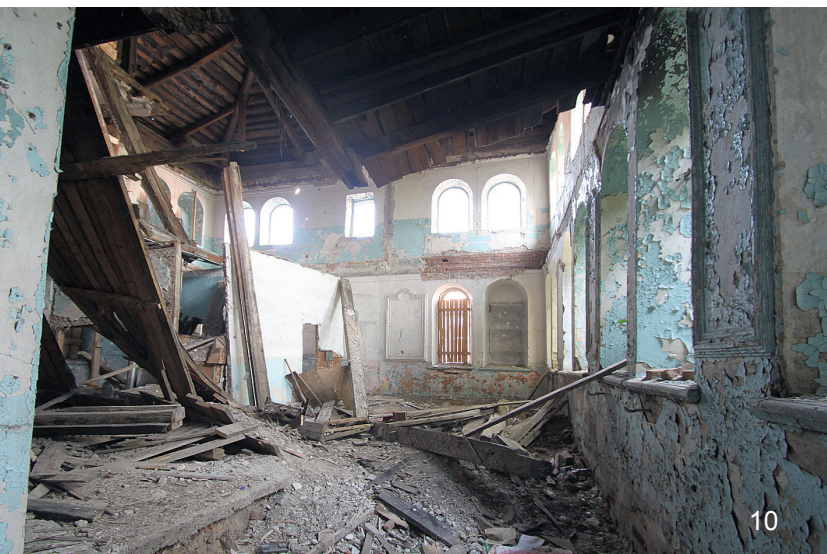
10–11 Mariinsk: Synagogue, interior towards east (10) and former entrance to the women’s gallery on the upper floor (11).

From Tomsk, the expedition travelled 220 km, partly on dirt-roads, to Mariinsk. In the late 19 th century, it was a fast developing town serving nearby gold mines. There, exiled Jewish convicts turned into respectable merchants who dominated the local trade. While Jews constituted only 10 % of the total population, in 1908 they accounted for 76 % of Mariinsk merchants. Thus, several dozen large brick houses which belonged to Jewish merchants stand along the central street of the town. According to the 2010 census, no Jews remain in Mariinsk.