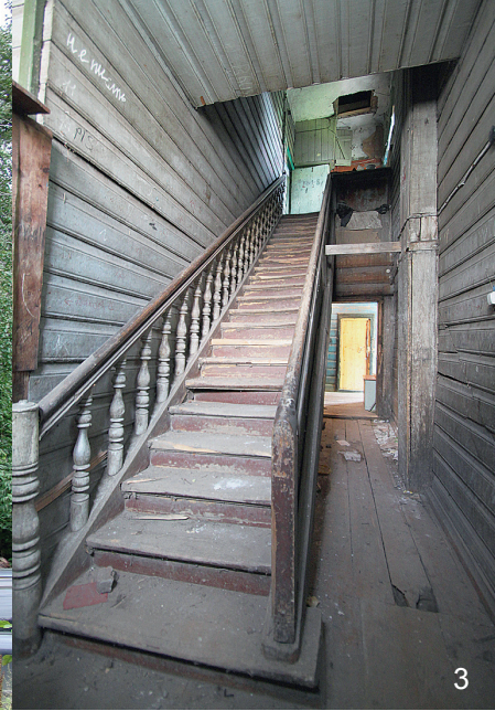
2–3 Tomsk: The Soldiers' Synagogue, view from southwest (2), staircase leading to the former women's section (3).