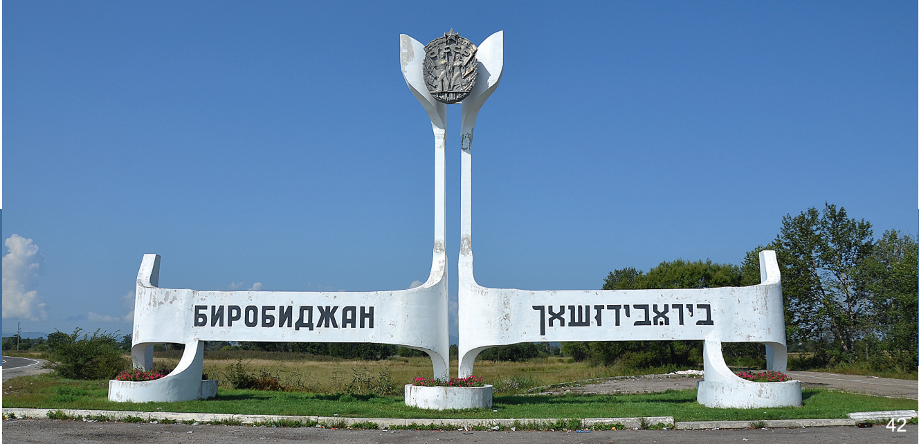
42 Birobidzhan: Entrance to the city.

The CJA team also surveyed Jewish tombstones in the old cemetery. Since Birobidzhan was a new Soviet city and the center of the Jewish Autonomous Region, the authorities never allowed for the establishment of a Jewish cemetery. Thus, Jewish tombstones are dispersed among non-Jewish graves, and only a small minority have Jewish symbols or epitaphs in Hebrew or Yiddish.